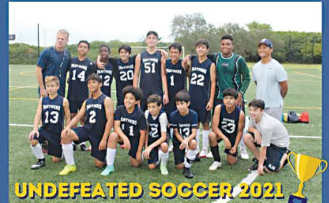
UNDEFEATED SOCCER 2021