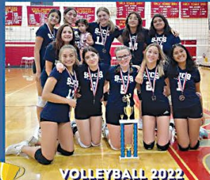
VOLLEYBALL 2022 1ST PLACE IN THE SILVER DIVISION