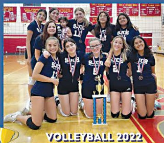
VOLLEYBALL 2022 1ST PLACE IN THE SILVER DIVISION