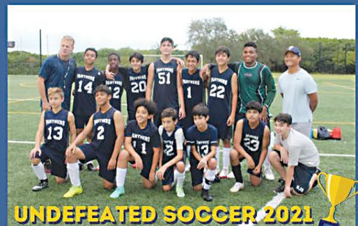
UNDEFEATED SOCCER 2021